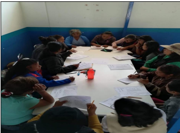
Work meetings with the inhabitants