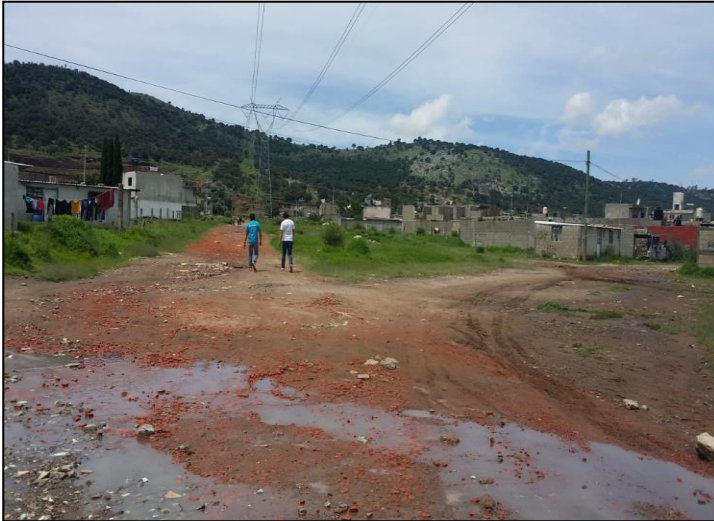
Periferia del centro de la comunidad

FURMEX Fondo Unido Rotario de México, A C