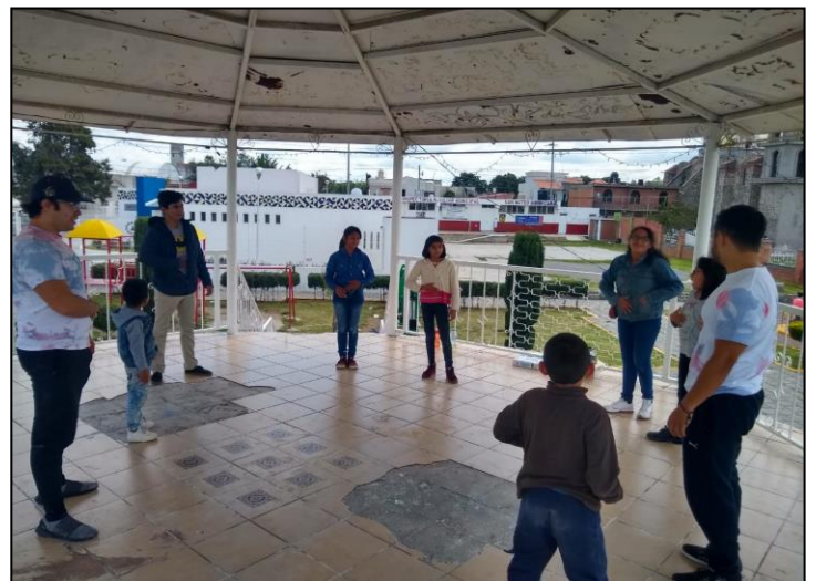
Population in the Kiosk