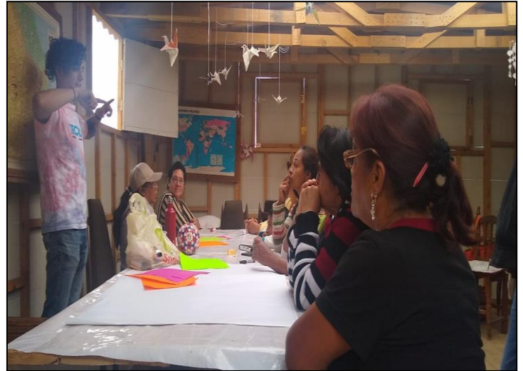
Workshops in the communitarian house