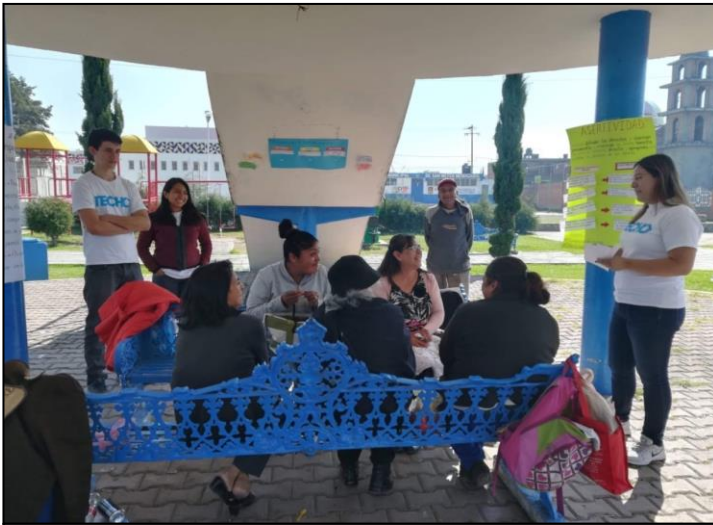
Inhabitants in the kiosk

FURMEX Fondo Unido Rotario de México, A C