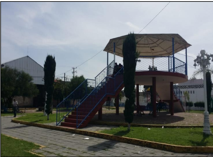
Kiosk of the park, area to intervene

* TECHO community headquarters, space available for neighbors to meet and organize.