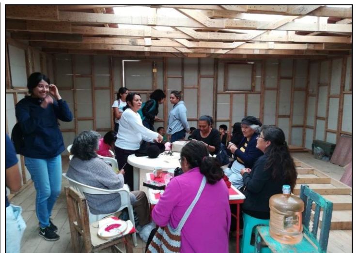
Inhabitans working in the communitarian house