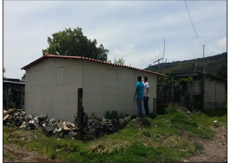
Sede comunitaria de TECHO, espacio disponible para que los vecinos puedan reunirse y organizarse